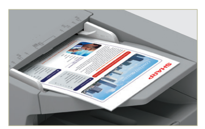
Easily scan documents, business cards and checks using the high resolution scanner.